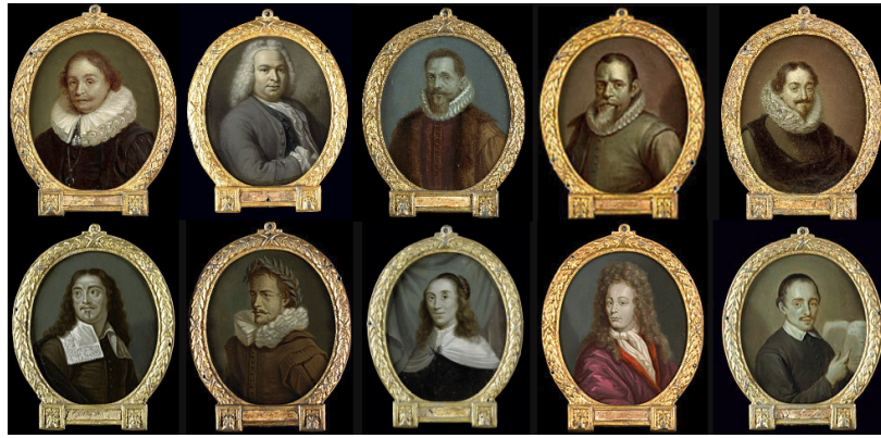
Figure 1: A selection of portraits that once belonged to the Panpoëticon, Rijksmuseum Amsterdam.

Along with popular views and partisanism, scholarship has been very instrumental in the shaping of the artistic and literary canons that, whether we like it or not, guide our views and understanding of art and literature in the past.