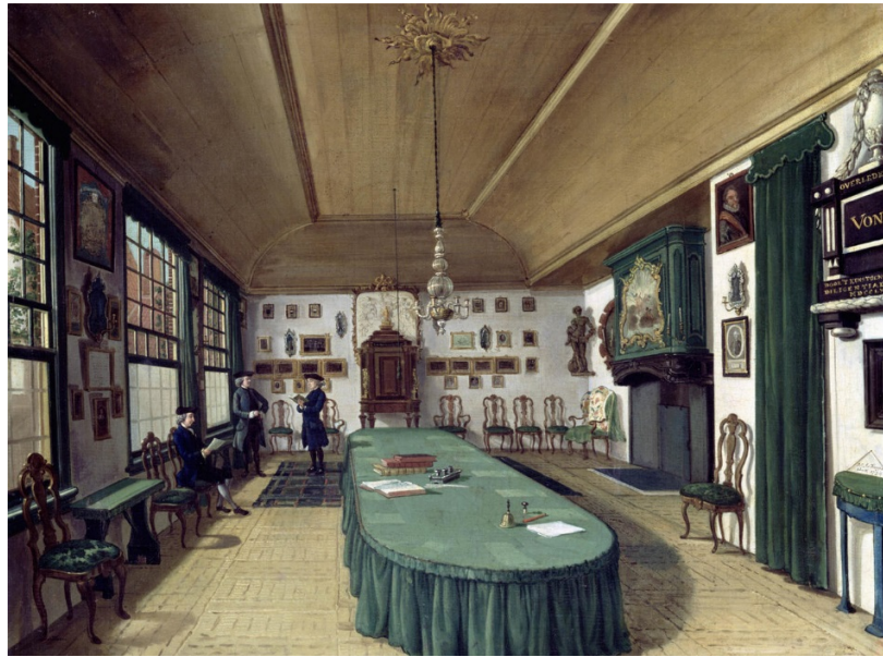
Figure 2: The meeting hall of the literary society Kunst Wordt Door Arbeid Verkregen with in the middle, at the end of the table the cabinet of the Panpoëticon Batavum. Paulus Constantijn la Fargue, oil on canvas, 1774. (Rijksmuseum Amsterdam / Museum De Lakenhal Leiden)

paintings up for sale. In a final, desperate attempt to clear its debts, it offered the Panpoëticon to the newly founded Koninklijk Museum, a direct precursor of the Rijksmuseum Amsterdam, for the hefty sum of five thousand guilders. Despite the fact that nationalism was by then the thriving idea in politics and culture, interest in the eighteenth-century and rather encyclopedic collection was limited and the society's offer was firmly rejected twice. The collection was eventually sold in 1819 and again in 1849. The then owner, a profit-driven art broker, sold the portraits separately and they ended up in collections all across Europe (Van Deinsen, 2017, 2020). The wooden cabinet itself was lost.